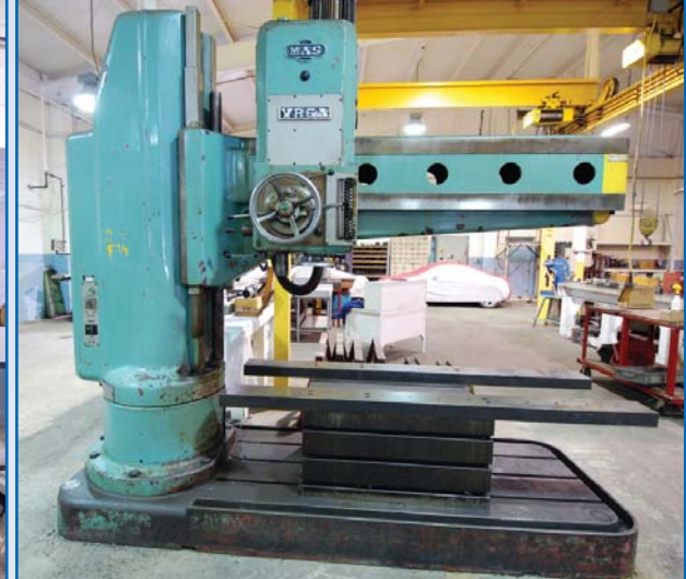
MAS 6' Radial Drill, Model VR6A