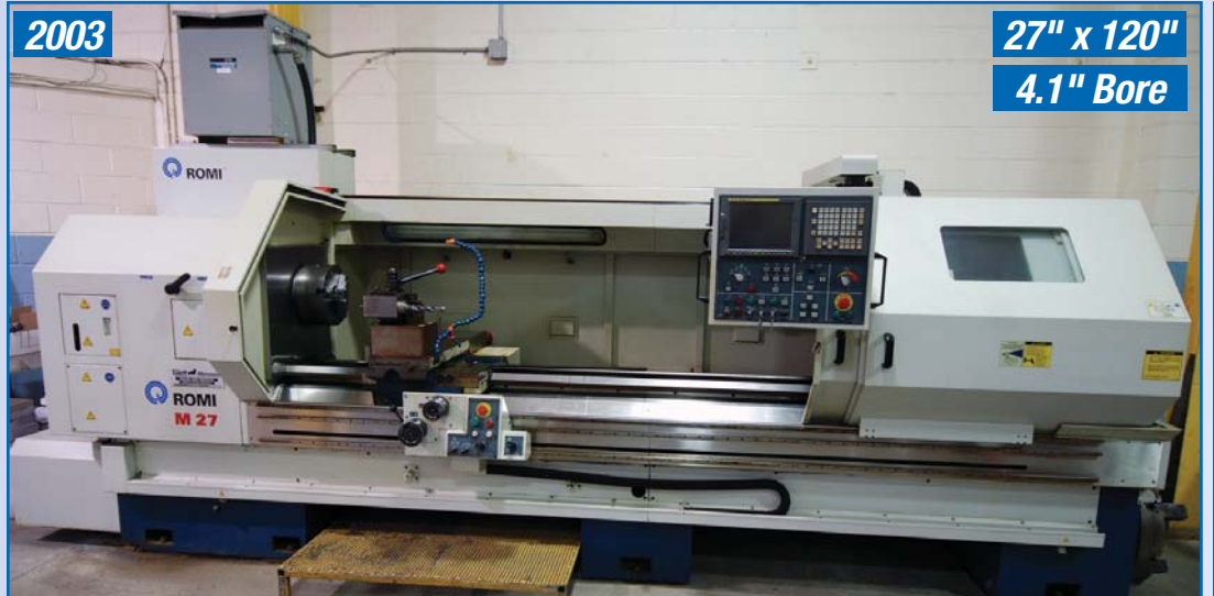
ROMI Model M 27 CNC Lathe