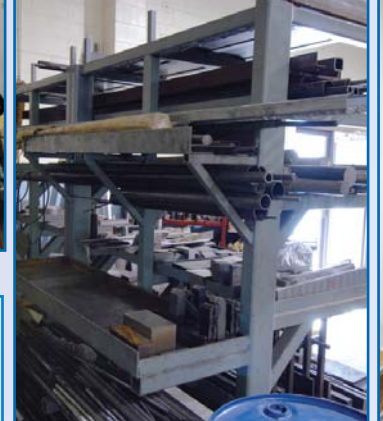
Partial View of Raw Material