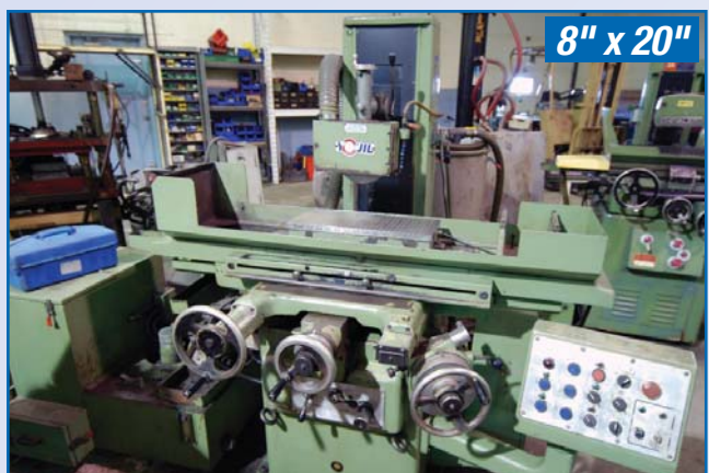
1 of 4 Surface Grinders Up To 18" x 72" YOUILL Surface Grinder, Model YGS524